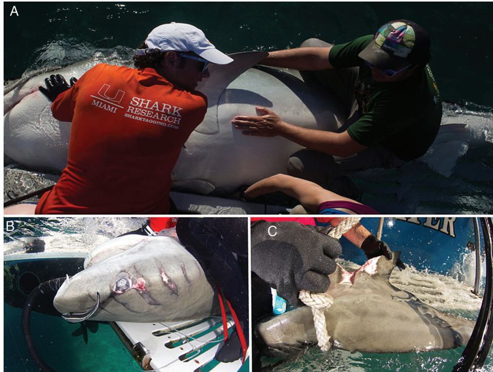
Figure 3: (A) An example of a high-condition/high-triglyceride value tiger shark with large girth from the present study, captured and sampled in October 2013. (B and C) An example of a low-condition/low-triglyceride individual captured on the same day, exhibiting physical trauma that is likely to have resulted from males biting the face and tail during mating.

did not, however, examine other aspects that are likely to impact condition values and triglyceride values. For example, in an analysis of 2120 dead dusky sharks ( Carcharhinus obscurus ), Hussey et al. (2009) showed seasonal changes in several metrics of condition. It would therefore be useful to examine seasonal changes in both triglyceride values and condition in tiger sharks, which would be especially valuable given the seasonal migrations that tiger sharks undergo and potential greater demands placed on female sharks during pregnancy.